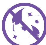
Eliminates volatile organic compounds (VOCs)