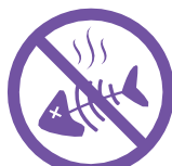
Eliminates odors and chemical contaminants