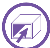
Installation : In-duct