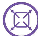
Purifies up to: 4,000 sq.ft.